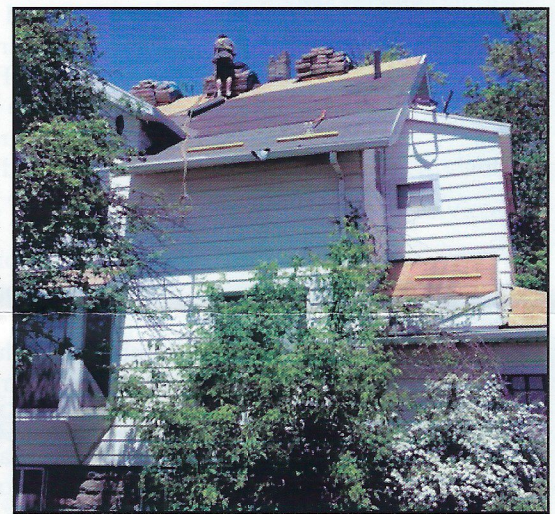
Out with the old, in with the new.

Since it was decided to stay at the present location, the Board will be seeking estimates for an ADA wheelchair ramp to be installed. Installing the ramp will either eliminate or greatly reduce the amount of property taxes